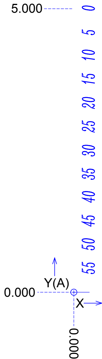
Seconds Dial Engraving